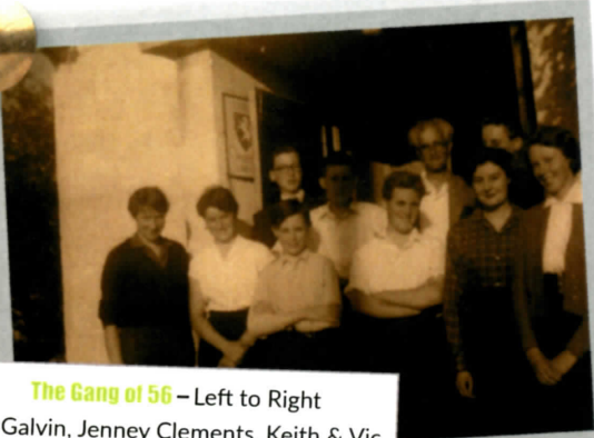
The Gang of 56 – Left to Right

leader, so for the sake of the story we will call them the Gang of 56. Not all but most started school at Wincheap Primary and then dissipated to various secondary schools, before heading out into the workplace and subsequently around the world. A nucleolus of the group kept in touch (predominantly the girls) with pen and paper, which was fortunate, as we knew where everyone was. Introduce the Internet and modern travel and we are fully back together and with the inclusion of spouses, partners and other family members make for a treasured group. The Hilltop News and Calendars find their way around the world, although the latter is now by e-mail and are much appreciated by old Hilltoppers. Once a Hilltopper always a Hilltopper.