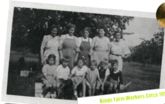
Kings Farm Workers Circa 1951

Being born in the war and growing up in Hilltop in the 40/50s was quite a unique experience, everyone knew everybody so as a kid you couldn't get away with anything, someone always saw you. Screens weren't a problem as there were only two (TV's) in the road. We witnessed the Hall being built by our Dads, supported by our Mums and on completion we were encompassed with a Youth Group, which lasted until we all went out into the workplace. Most of our Mums worked at King's Farm (New House Farm), which became our playground in the summer holidays. Looking back now what an adventure it was. We were a mischievous lot but generally a good bunch but we had no name or obvious