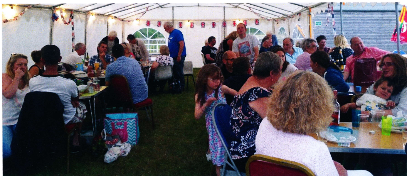
A happy community scene in the marquee at the Summer Family Barbecue Event

After a world of many greens it was a delight to find ourselves looking at some meadow grassland with three different kinds of orchids namely bee orchids where the most conspicuous part of the plant looks remarkably like the rear of a small bumble bee visiting it, bright deep pink pyramid orchids and the well known common spotted orchid with flowers varying from white to pale mauve or a deeper purple. Jan Armishaw