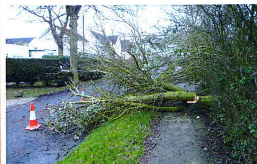
Freak weather brings down tree in New House Lane