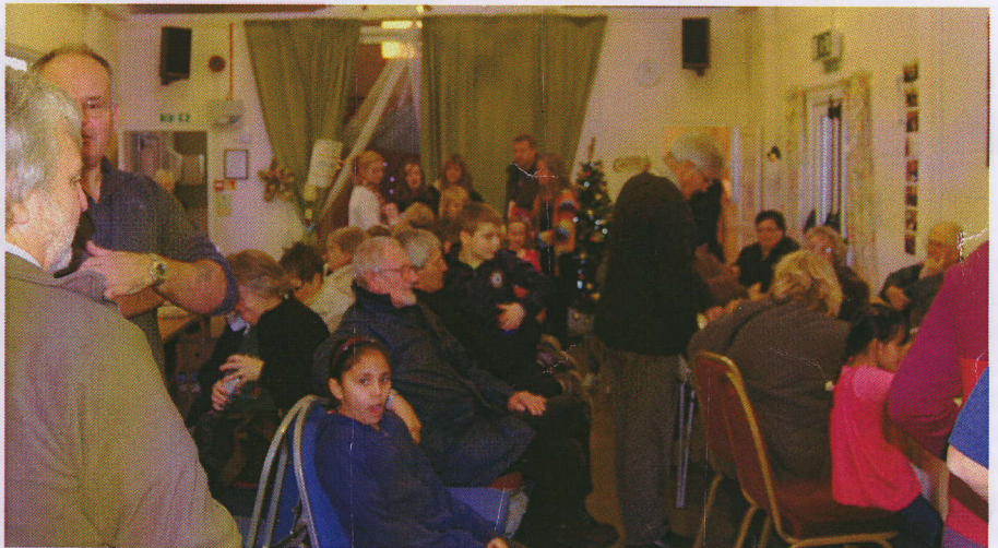
Above everyone enjoying the Christmas Fair